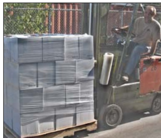
Mike off to deliver the next shipment!